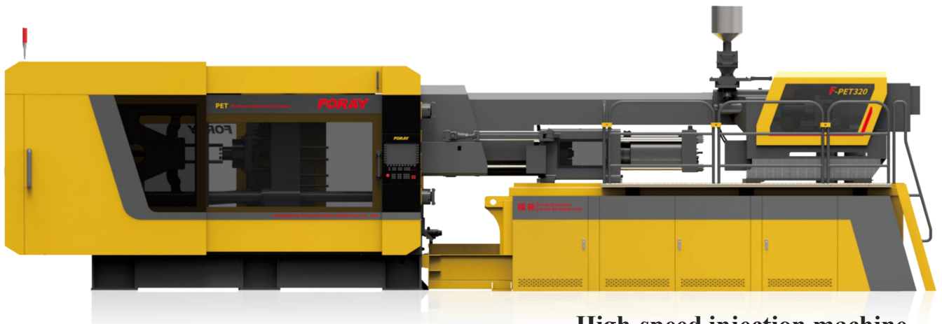
High-speed injection machine