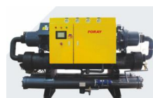
Cooling water machine